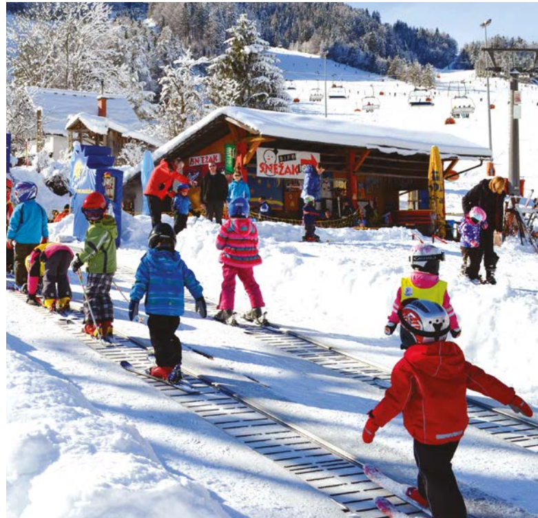
Children at ski school in Kranjska Gora